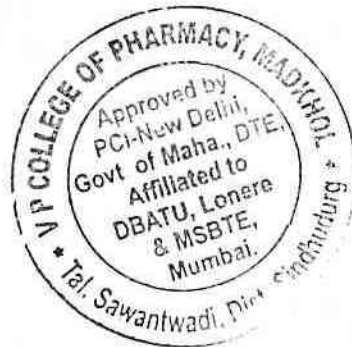
Principal V P College of Pharmacy, Madkhhol Tal. Sawantwadi, Dist. Sindhudurg